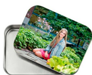
wallet tin 2 - 75