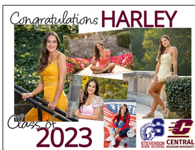
vinyl senior banners 3' x 4' one image 100 3'x4' collage 375