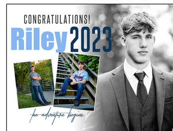
18x24 2-sided yard sign 50