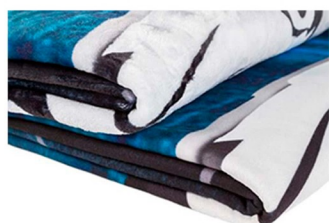
velveteen plush blanket 80x60 125

All products are on display at The Studio for ordering sessions.