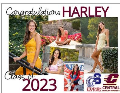
vinyl senior banners 3' x 4' one image 100 3'x4' collage 375