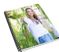
spiral keepsake album 150