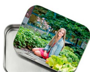
wallet tin 2-75